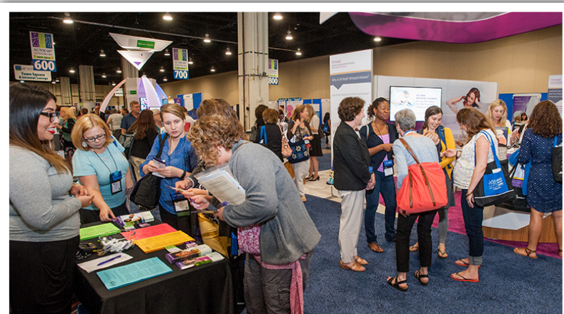
Exhibit Hall and Midwifery Market open Buffet brunch 10:30AM–12:00PM