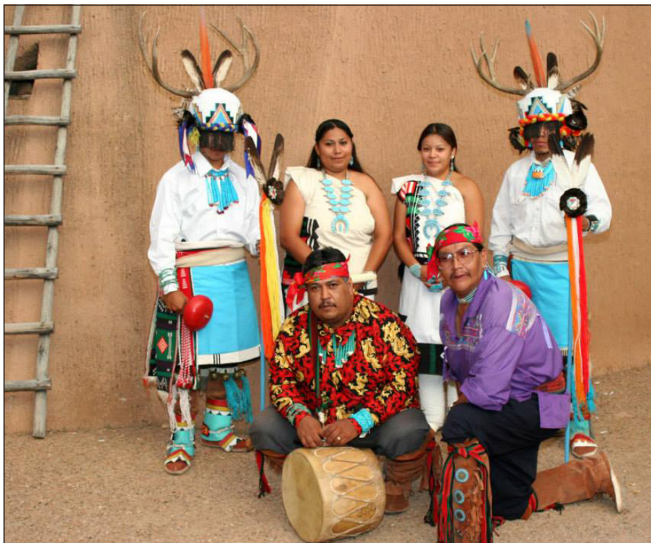
Enjoy the Cellicion Zuni Dancers at the Opening General Session. The group consists of 15 family members and is world-renowned for their performances of traditional Zuni social songs and dances.