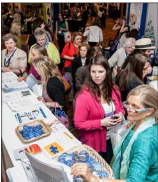
Exhibit Hall Hours

The Midwifery Market is open to both general retailers and ACNM affiliates interested in selling items for fundraising purposes. This perennial favorite always draws a crowd, so don't wait on the opportunity to pick up unique midwifery-themed gifts for your colleagues and family—or for yourself!