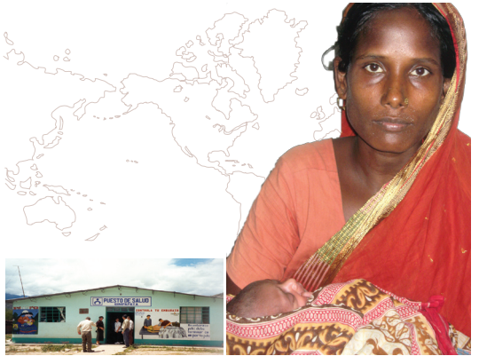
(continued on page 13)

First developed in 1990, LSS has been used by nongovernment and government organizations in Africa, Asia, the Americas, and the Caribbean (read more on page 9). For more information about the A.C.N.M. Foundation's 2008 accomplishments, please see our online report supplement at www.midwife.org/annualreport2008.cfm.