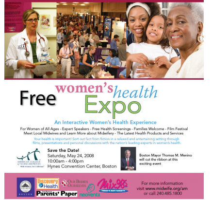
Over 500 signs on public buses and trains promoted the consumer-focused ACNM Women's Health Expo.

ACNM staff used the core messages to write this syndicate press piece, which generated 172 news articles in 16 states, reaching more than 6 million readers.