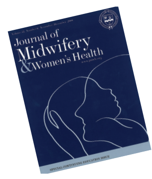
The Journal of Midwifery & Women's Health processed 307 submissions with an acceptance rate of 30%.

ACNM contributes to and refines the pool of evidence-based research that guides care for women and babies. In 2008, our peerreviewed journal, the Journal of Midwifery & Women's Health, published a groundbreaking study, "The Lived Experience of Widowhood in Pregnancy," which examined experiences of pregnant women whose husbands died in the 9/11 attacks or while serving in the US military. This was the first study to examine the experiences of pregnant widows. Two continuing education issues were published: "Infectious Disease" and "The Effects of Violence and Trauma on Women's Health." JMWH also launched "Global Exchange," an online column for international women's health reports.