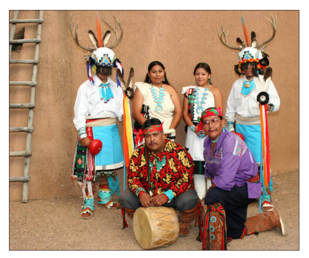
Enjoy the Cellicion Zuni Dancers at the Opening General Session. The group consists of 15 family members and is world-renowned for their performances of traditional Zuni social songs and dances.